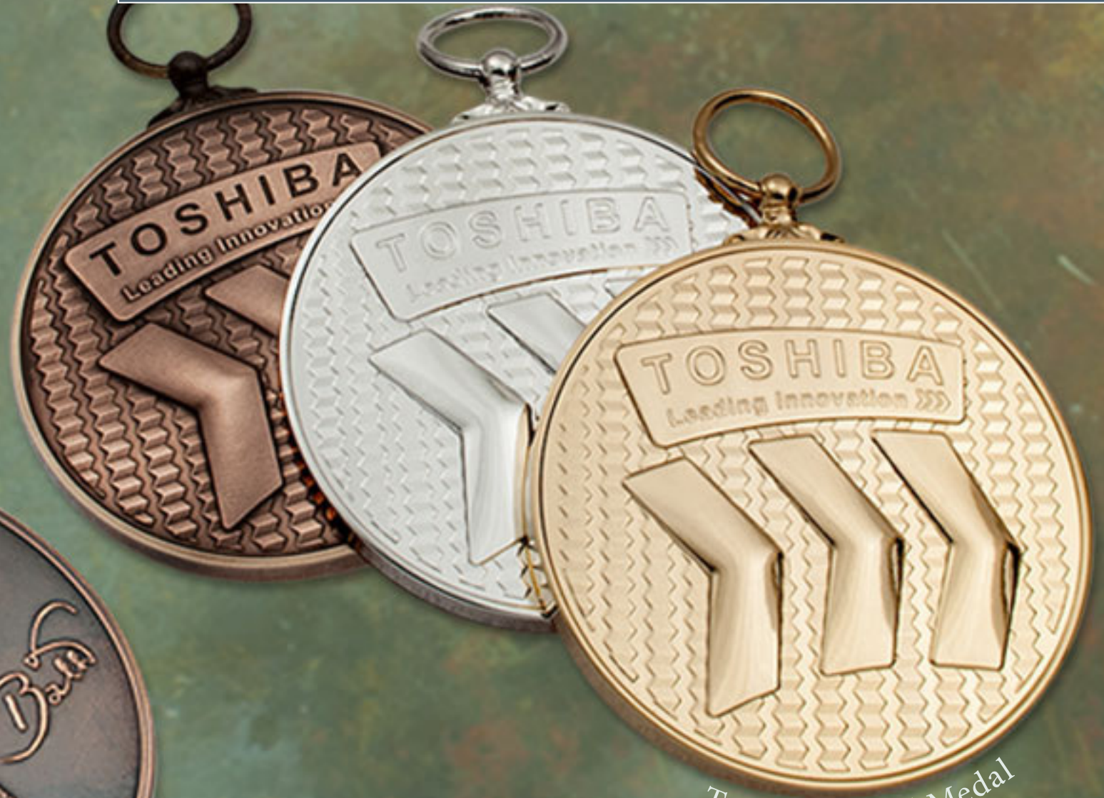
Toshiba Award Medal

We can use a special wax on bronze surfaces to provide protection when handled, and ensure your medals look absolutely great for years to come.