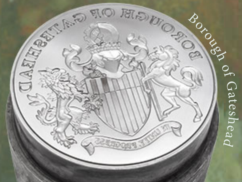
Borough of Gateshead

The medal dies displayed above are working dies from a recently completed commission. Dies must be carefully maintained and stored as even minor blemishes on their surface can be transferred to the pressed medal.