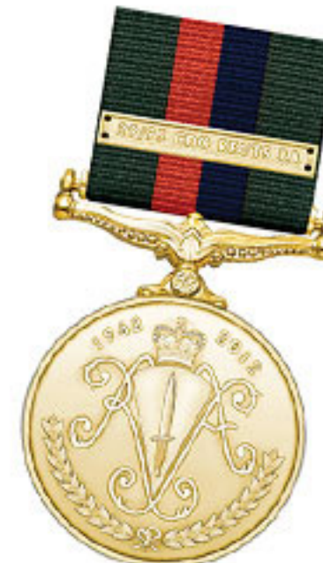
Medal Front (Engraved)