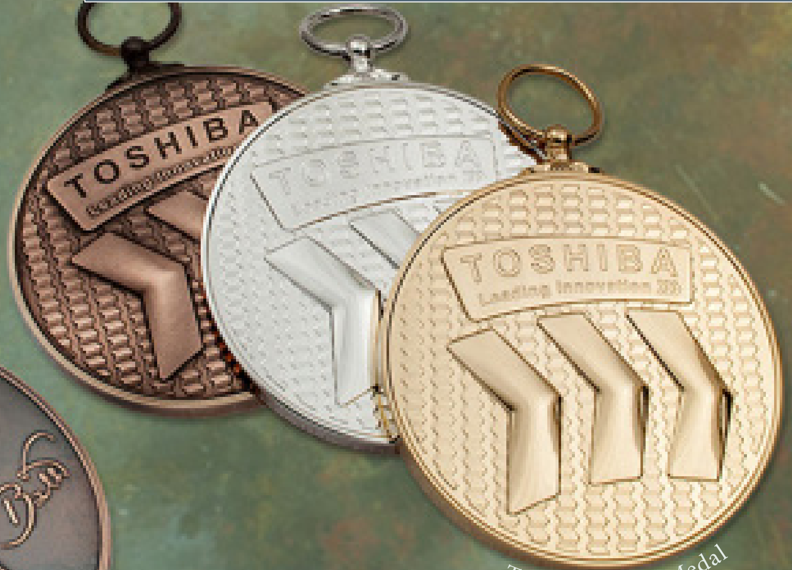
Toshiba Award Medal

We can use a special wax on bronze surfaces to provide protection when handled, and ensure your medals look absolutely great for years to come.