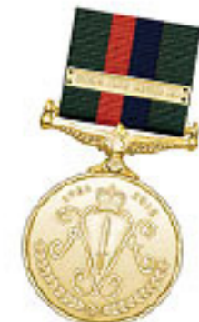
Medal Front (Engraved)

During this stage we will discuss your requirements and design ideas with you. We can use your existing sketches, logos and crests or even create something completely new for you.